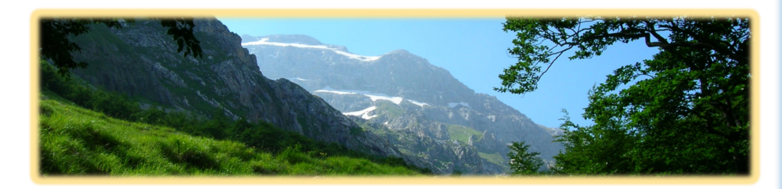
April 16 Our prayer stemps from the wish and commitment of the Sisters of Romania, who celebrate their III Provincial Chapter with special focus on John 15, 4.8.11: "Remain in me and I

May the Lord bless them and their Mission!